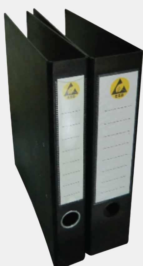
ESD RING BINDER