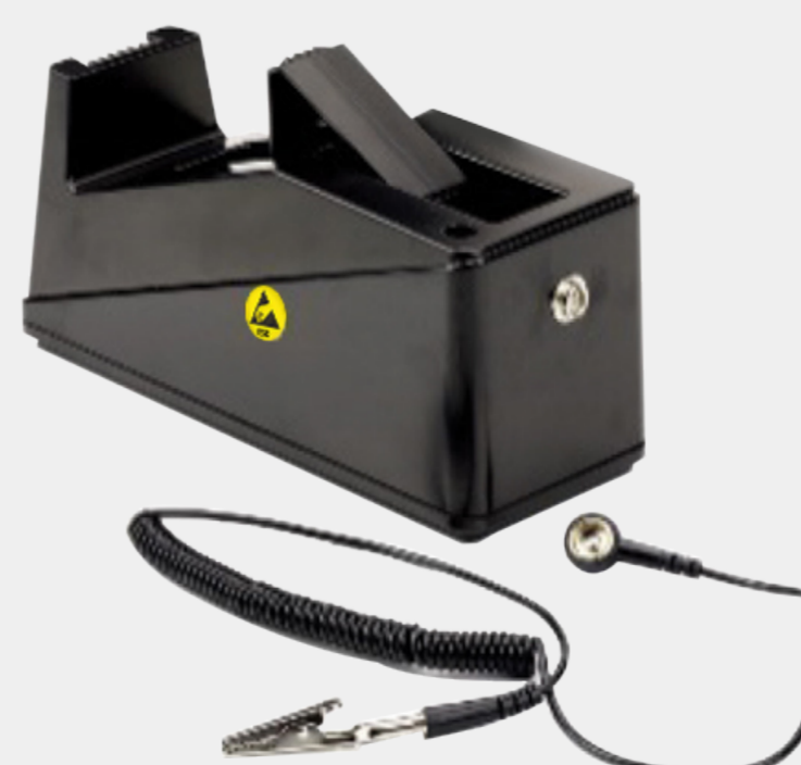
ESD TAPE CUTTER